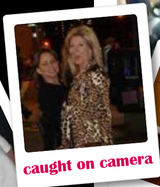
caught on camera