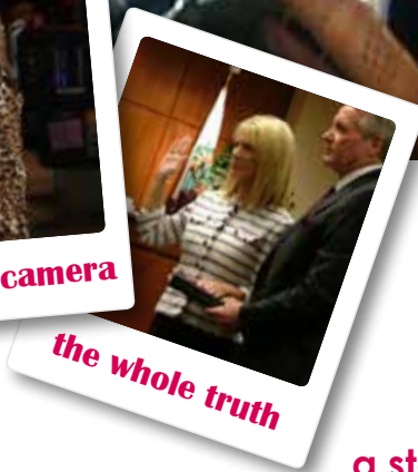
the whole truth